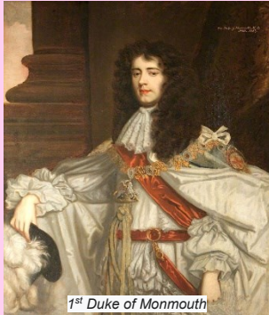
1 st Duke of Monmouth

Who would choose to battle on the sodden Somerset Levels? What were they fighting about?