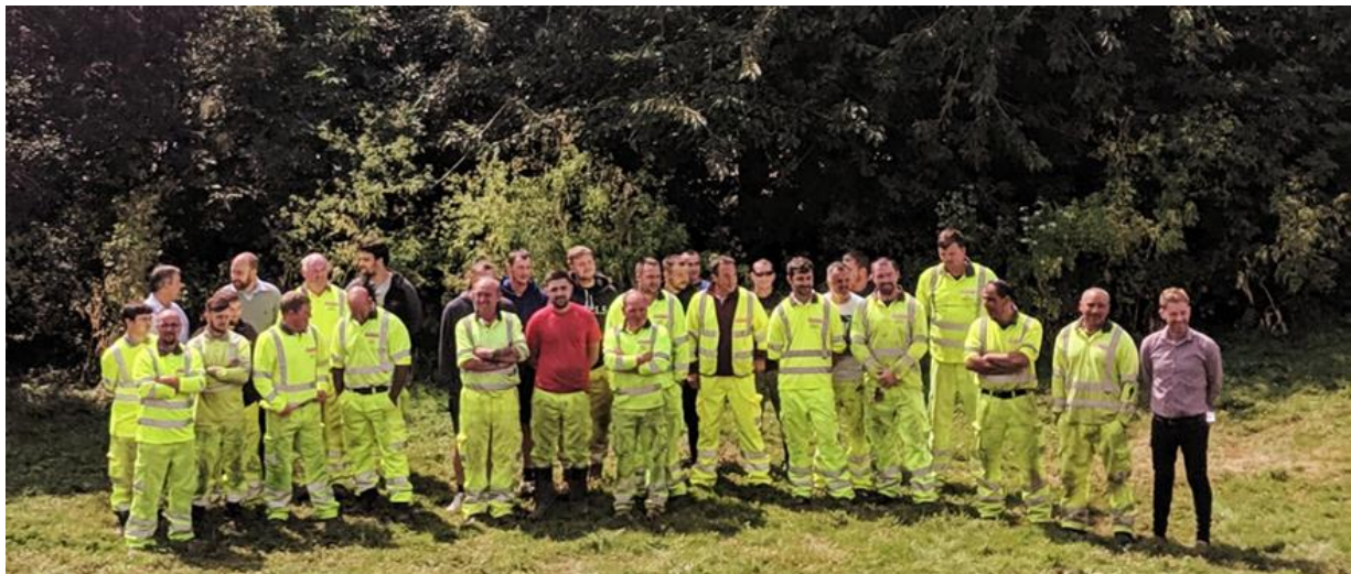
Our Operatives and Civil Engineers working on Junction 25 at the Safety Stand-down Day

Our Management Team on Junction 25 provided a BBQ to say thank you to our staff for all their continued hard work.