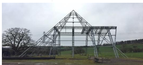
The Pyramid Stage