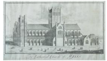
The Cathedral Church of Wells, 1794